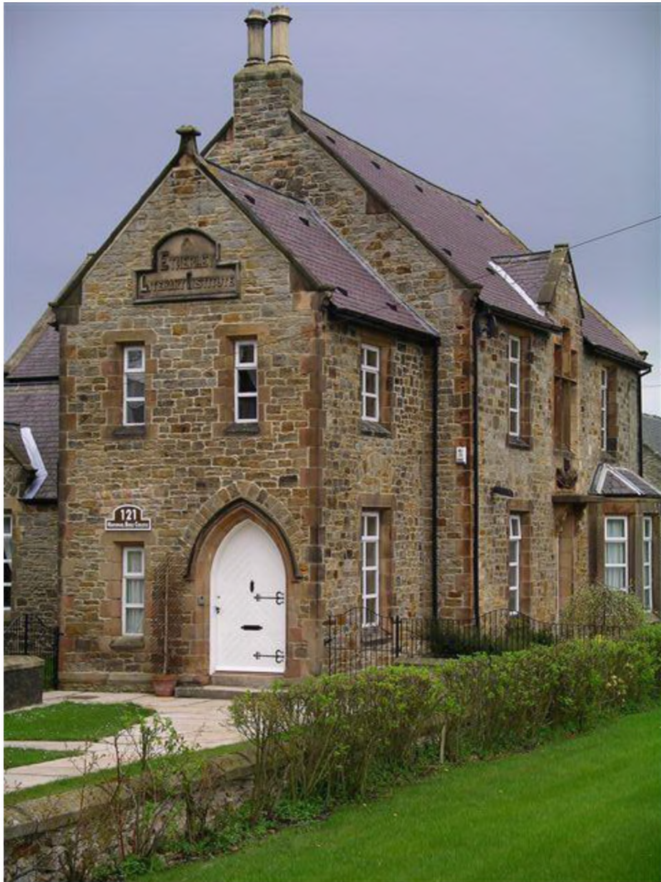
The National Bible College